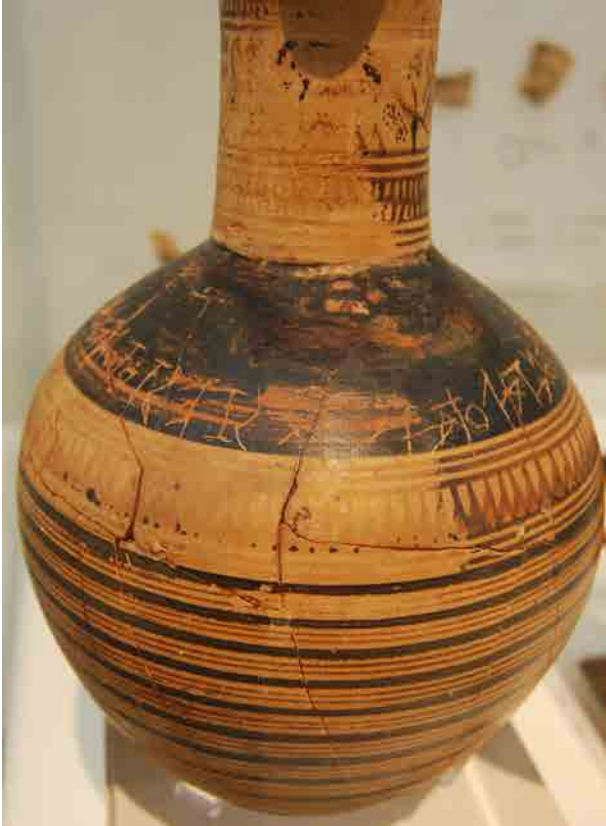
FIG. 4.1A Attic oinochoe, c. 740 BC, from Dipylon

ing place in the here and now of repeated ritual. In a sense, the temporality of the dance ( \nu\hat{\nu}\nu ) materializes into the physical presence of the vase ( \tau\acute{o}\delta\epsilon ), and the correspondence between the adverb and the pronoun of proximity emphasizes that the object is somehow the equivalent or the substitute of the dance. Equally noteworthy is the display of the inscription around the vase, which, through the form and direction of the letters and by echoing the movement of the geometric bands below, seems to be trying to imitate the movement of the dance to which it alludes. A later, more explicit example of this choral layout of the letters on a vase can be seen on a Corinthian aryballos depicting a dancer and a flute-player (fig. 4.2), on which the movement of the dancer is suggested through the sinuous disposition of the letters of the inscription, which again alludes to the dance itself. It could be objected, of course, that the primitive, tentative character of such an early example of writing as that on the Dipylon