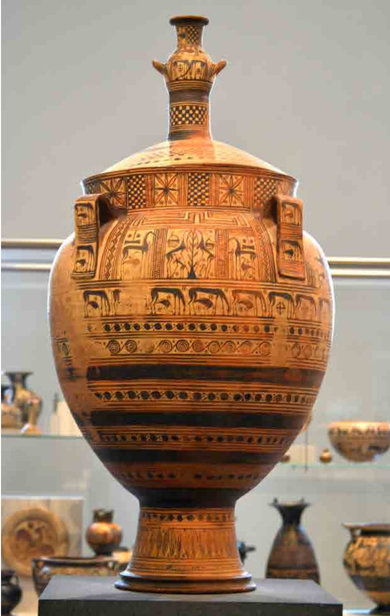
FIG. 4.8 Euboean LG crater from Cyprus by the Cesnola Painter METROPOLITAN MUSEUM OF ART, NEW YORK (1874.51.965).