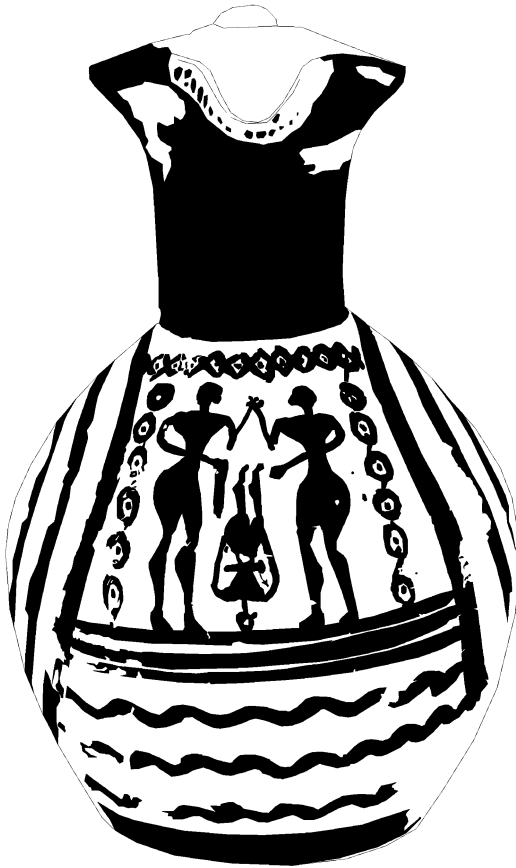
FIG. 4.10 Oinochoe, c. 735–720 BC. Boston 25.42, Richard Norton Memorial Fund.