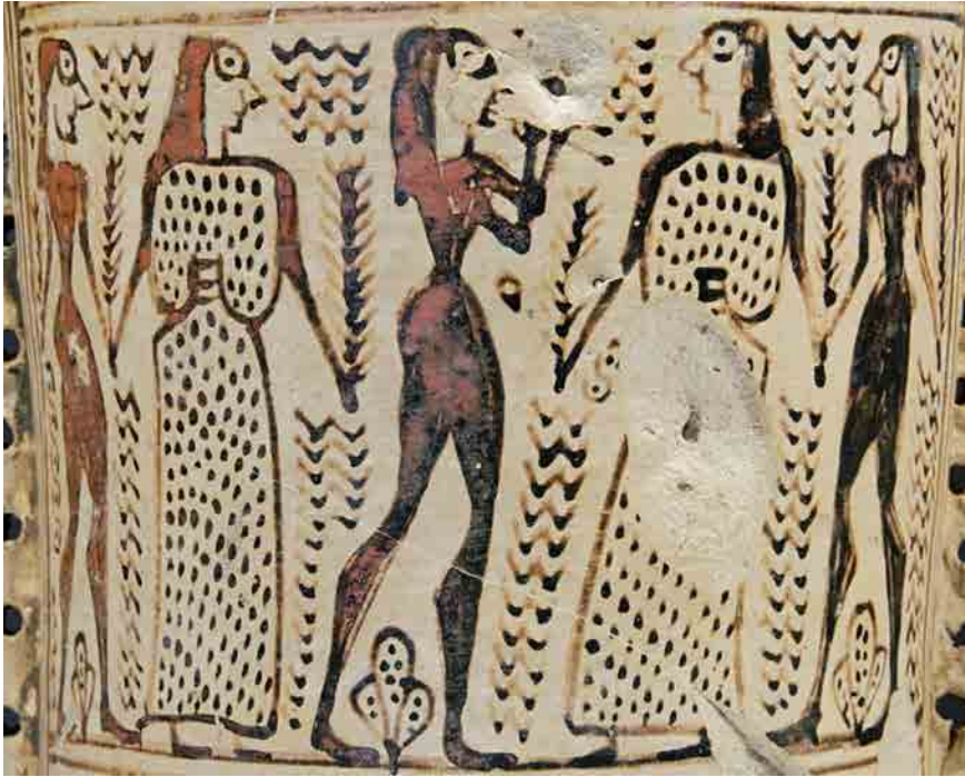
FIG. 4.14 Couples dancing. Neck of Attic (EPA) loutrophoros, by the Analatos Painter. LOUVRE CA2985.

the spectators enter the world of the chorus, believing that they are the ones singing, and by this mirroring look they are conferred with the quasi-divine beauty of the κόρραι as well as their collective identity as Ionians. But at the same time the chorus connects also the poet, the blind man from Chios, with his audience, the Ionians to whom the girls will confirm his excellence and that of his poems.