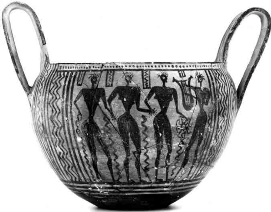
FIG. 4.11 Kantharos. Boiotian. Late 8th century BC. STAATLICHE KUNSTSAMMLUNGEN ZV 1699.

robes, in contexts of wooing and seduction, 43 and (ii) the pupil can be simply called the κόρη, evoking the image of a maiden at the centre of a circular