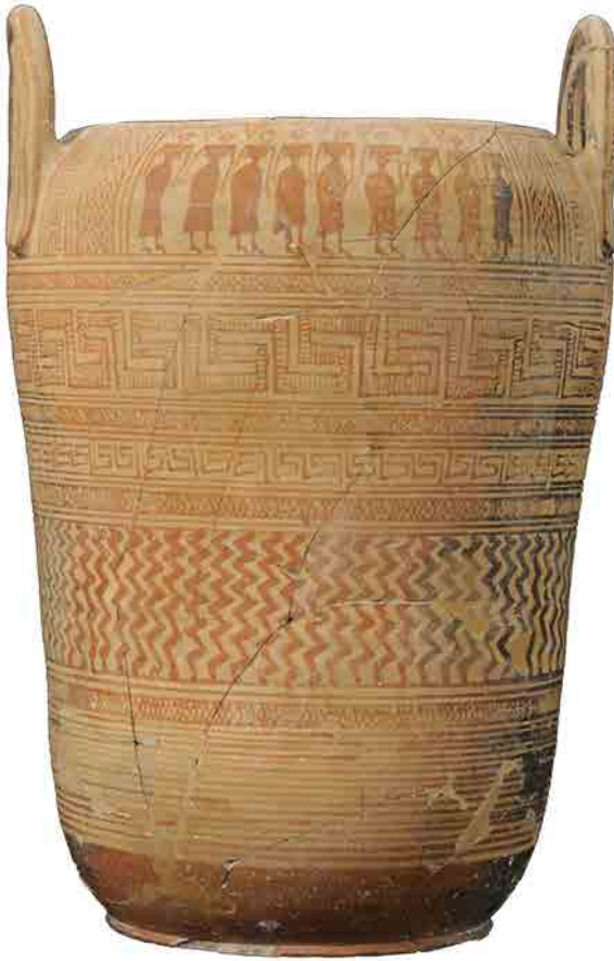
FIG. 4.13 Boeotian LG pythoid jar, from Thebes ARCHAEOLOGICAL MUSEUM, THEBES BE469.

and to the Hesiodic poems, or the three choruses scanning the Homeric Hymn to Apollo (the Deliades at the end of the first, Delian part; the Olympians at the beginning of the Delphian section; and the processional chorus of the Cretans turned Delphians at the end). As all these examples show, this liminal position is not a minor, marginal one, but rather has a crucial importance in defining the place where mimesis takes place, where the exterior and the interior of the song, as of the iconographic space, meet and interpenetrate each other. This is, in my view, the main function of the choral mimesis, as presented in the well-known scene of the chorus of the Deliades in the Homeric Hymn to Apollo (ll. 156–176). Through the contemplation of their extraordinary, mimetic voice,