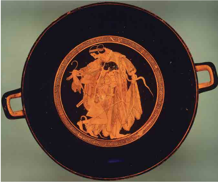
FIG. 4.16 Attic Red figure kylix STAATLICHE MUSEEN, BERLIN (INV. F2279). THETIS AND PELEUS.

violence). 48 The κόσμος that is the ornamentation is at the same time the κόσμος as an ordered and articulated world. In this respect, the iconographic language of Geometric pottery is the first episode in a long series of sophisticated experimentations with the power and limits of the image that is so characteristic of Greek art. The analysis of these iconographic strategies, recognized as deriving from the cultural model of chorality, can help us in turn understand better similar strategies in poetry, as they were 'looked at' and 'read' by the audience.