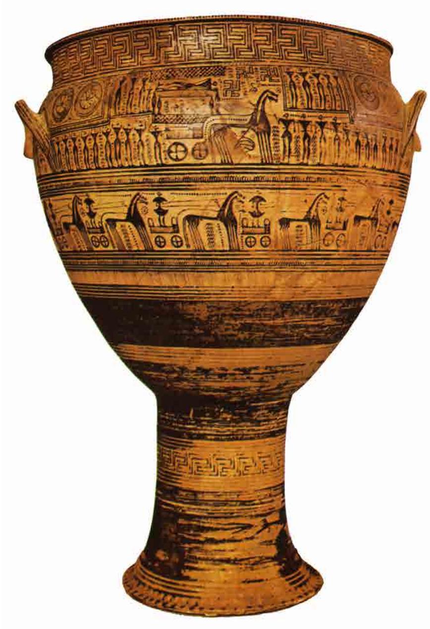
FIG. 4.4 Attic crater (LG1b), c. 740 BC, from Kerameikos