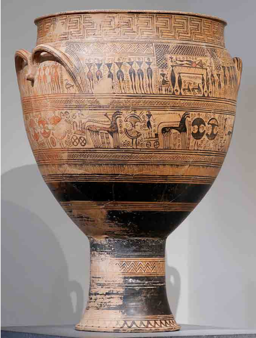
FIG. 4.9 Attic crater (LG1b), c. 740 BC, from Dipylon METROPOLITAN MUSEUM OF ART, NEW YORK (ROGERS FUND, 1914, 14.130.14).