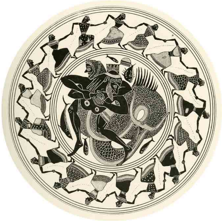
FIG. 4.15 Heracles and Triton. Attic Black figure kylix. TARQUINIA MUSEUM (RC4194) DRAWING: J.E. HARRISON, D.S. MACCOLL, GREEK VASE PAINTINGS; A SELECTION OF EXAMPLES, LONDON 1894.

poem, that enables the poet to tackle the articulation of the Greek heroic world in the Catalogue of Ships, as Hesiod does in his works. Similarly, I would argue here that the potter too appropriates the active mimetic power of the choral performance, not only through the frequent representations of choruses, often in liminal spaces, but more generally through the extensive use of geometric patterns, first exclusively, and later in a framing relationship to the figured scenes. In this way, the chorus does not need to be actually represented to give the image its power of fascination, its ability to mirror the world surrounding it and project onto it its ideal images of order or heroic past (though it must also be stressed that, as in Demodocos' song, it can also do so in an inverted manner, as shown by the frequent representations of monsters, shipwrecks, or scenes of