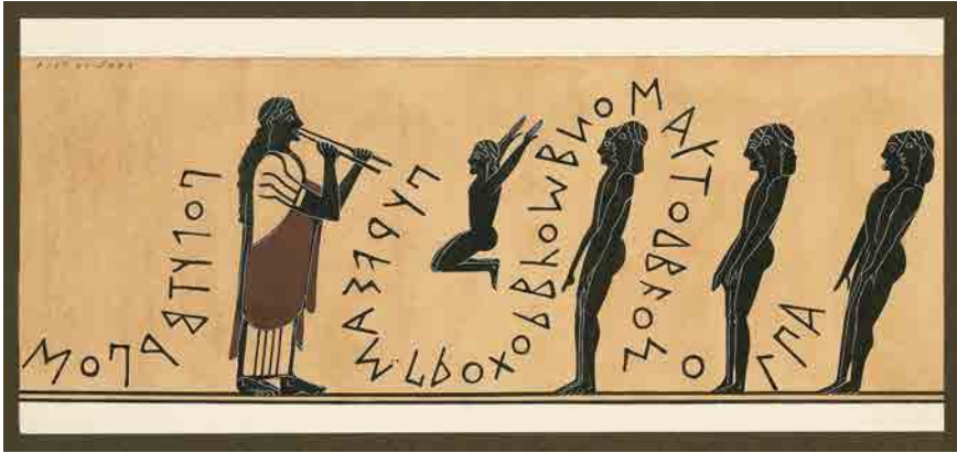
FIG. 4.2 Corinthian aryballos, with representation of dance and inscription, c. 590–580 BC ARCHAEOLOGICAL MUSEUM, CORINTH (CORINTH C-54–51). DRAWING: P. DE JONG.

need to develop here. 32 But the point I would like to make is that the multiple levels of the visual apprehension of the performance by its audience, as we have seen in the epic texts, may have a close parallel in the reading of the iconography of the Geometric period (1000–700 BC), especially the Late Geometric (second half of the eighth century), during which the figured image coexisted with the geometric decoration.