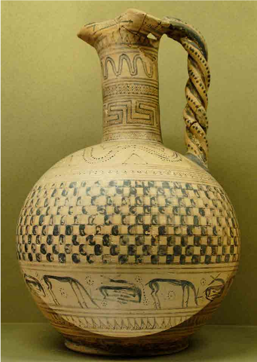
FIG. 4.7 Late Geometric oinochoe, c. 750 BC MUSÉE DU LOUVRE (CA1821). WIKIMEDIA COMMONS (PUBLIC DOMAIN).