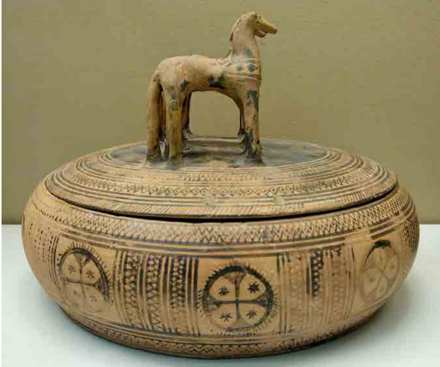
FIG. 4.6 Attic pyxis (MG II), c. 760–50 BC BRITISH MUSEUM (LONDON 1910.11-21-1).

that these geometric motifs are not necessarily a stylized representation of the dancers, thus ultimately a figured iconographic language, but rather a visual rendering of the same abstract patterns that the dance traces on the ground for the brief duration of the ritual occasion, representing and fixing down the ritual action in images as the poet of the Iliad does in words. That these patterns could eventually be read as evoking some choral images within a fixed and codified repertoire is suggested by the texts and by those images where figures and geometric motifs echoing each other are juxtaposed, but this attribution of meaning was not compulsory and could vary according to the occasion and even perhaps the individual viewer. Thus, there is no point in trying to assign a single, specific meaning to each of the motifs, but, on the other extreme, neither should they be considered as having no iconographic meaning at all.