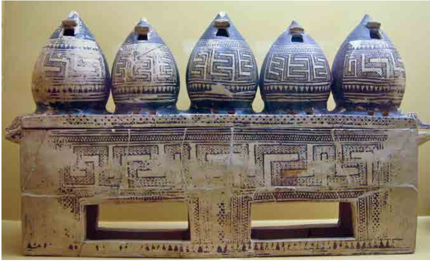
FIG. 4.5 Attic chest (MG I) with model granaries AGORA MUSEUM, ATHENS (P27646).

Also very common are the circular motifs, often in the form of concentric circles, which sometimes encircle another element in the centre, such as a dot, a cross, or a figured motif, such as an animal. Sometimes these circles are linked by tangential lines (fig. 4.8: note the bands under the grazing animals), giving concurrently both the impression of movement, like the meander, and of a combination of pieces, like a necklace or, indeed, a dancing chorus. In other cases these circles adopt a quasi-representational form, like a flower or, in a characteristic motif, an object resembling at the same time a wheel and an astral body, like the sun or the star-crowned heaven of the innermost band of the shield (fig. 4.6). Stars are also frequent, as is the swastika, possibly also an astral motif. As for the frequent grid patterns, made up of straight or diagonal lines, chequered or filled with dots, we have already encountered them in the intersecting στίχες of the dance, which could be read, for instance, as a web or a military or ritual formation (fig. 4.7).