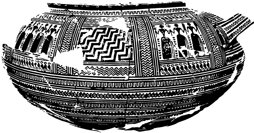
FIG. 4.3 Argive crater (Late Geometric), from grave T45 in Argos

DRAWING: PALOMA ALIENDE (CATALAN INSTITUTE OF CLASSICAL ARCHAEOLOGY).