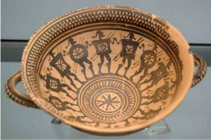
FIG. 4.12 Dancing warriors. LG cup. STAATLICHE MUSEEN, BERLIN (INV. 6029).

the representation of the arrival of Theseus and his companions to Delos on the François Vase). A kylix from Tarquinia (fig. 4.15) offers a very interesting example, with Heracles and Triton at the centre and a chorus of girls (which can also represent Nereids) surrounding them. The centre of the space is occupied by the clasped hands of Heracles imprisoning Triton in a wrestling hold, an ἄφυκτος δεσμός (like that of Hephaestus' web in the Odyssey ) represented here as a labyrinthine meander which echoes the locked hands of the surrounding chorus. This becomes even more evident if compared to another Attic red-figure kylix with the battle of Thetis and Peleus (fig. 4.16). Here, the place of the chorus is occupied by a geometric band, a περιπλοκή exactly reproducing the central clasped hands motif, which in this mythical context is a nuptial as much as a wrestling motif.